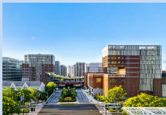
Zhengli Campus (trial run)